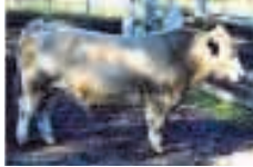
Sire: M. Flintoff