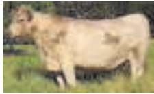
Dam: B. Joyce A22