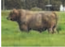
Maternal brother: B. Zone Z27

Born: 29/04/2008 Age: 20.7 months Tattoo: JOS D40 Colour: Grey MG % : 100 NLIS : WKAM0344XBDD0040 NFID: 982 000118810020 Pen: 1